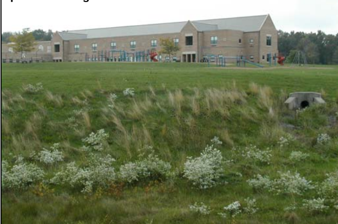
This naturalized basin in Montgomery County has been planted with grasses and wildflowers

An extended detention basin and rain garden planted with a variety of wet meadow plants provides better treatment of stormwater and poses less of a mosquito problem than a basin planted with turf grass because frogs, dragonflies, and birds that will thrive in a wetland meadow ecosystem will act as natural controls.