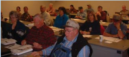
Nutrient Management Workshop Crowder College • Jan 13, 2005

This project is helping to create a greater understanding of poultry nutrient management in SW Missouri. Through this advanced understanding, this project will improve nutrient management in SW Missouri by encouraging economical use of available nutrients without producing harm to the aquatic ecosystems in the region.